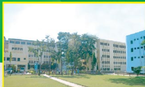
Panoramic view of the campus