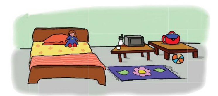
Page no- 47

This is a picture of a bed room. In this picture there is a bed in one corner of the room. A doll is on the bed. There are two tables beside the bed. We can see a box, a vase and a glass of milk on one table. There are some flowers in the vase. A ball is under the other table. A bag is on the table. We can also see a mat on the floor. The picture looks very nice.