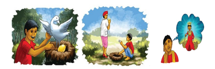
Page no- 59-60

We can see a picture of a forest. In this picture there is a tiger. The tiger is trying to hunt a deer. So, it is running after the deer. The deer is running fast to flee away. The picture looks very nice